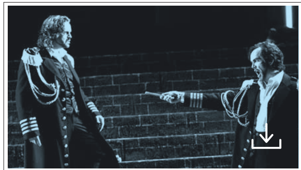
LA FORZA DEL DESTINO