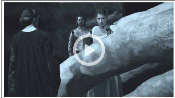
FRANCESCA DA RIMINI