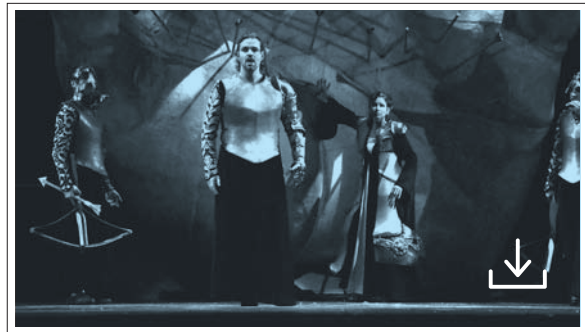
FRANCESCA DA RIMINI