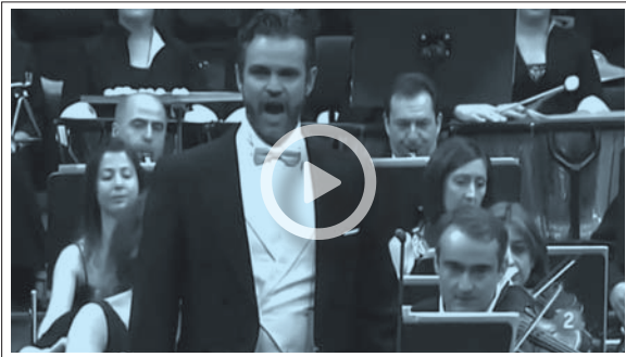
LYRIC GALA RTVE